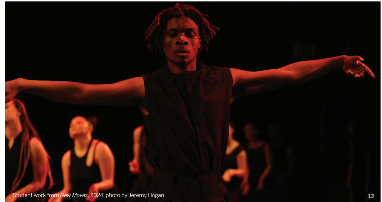
Student work from New Moves, 2024

English Composition Mathematical Modeling Public Oral Communication Intensive Writing Foreign Language (second-year, second-semester proficiency) Culture Studies Critical Approaches Arts & Humanities (covered by dance major coursework) Social and Historical Studies Natural and Mathematical Sciences