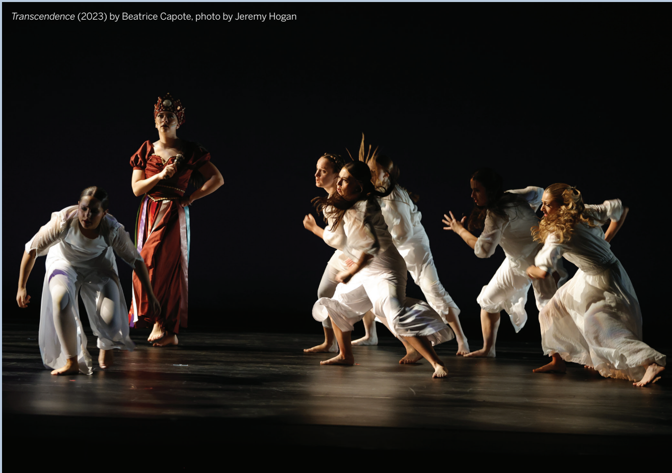
Transcendence (2023) by Beatrice Capote