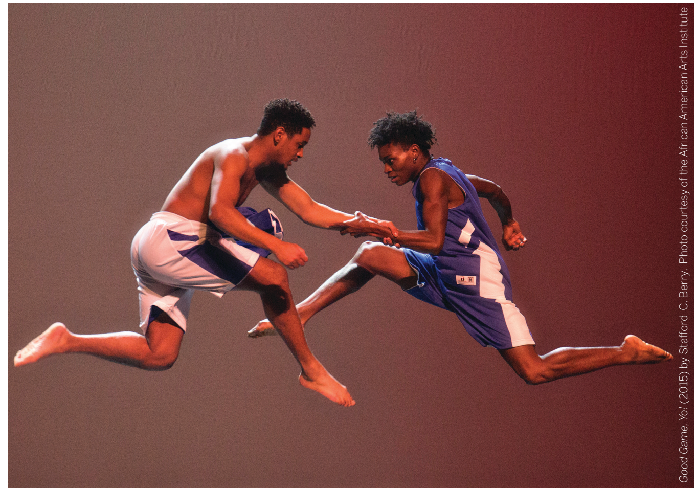
Good Game, Yo! (2015) by Stafford C. Berry. Photo courtesy of the African American Arts Institute

Dance for PD® offers dance classes for people with Parkinson's disease in Brooklyn, New York and through their network of partners and associates in more than 100 other communities in 11 countries around the world. In Dance for PD® classes, participants are empowered to explore movement and music in ways that are refreshing, enjoyable, stimulating and creative.