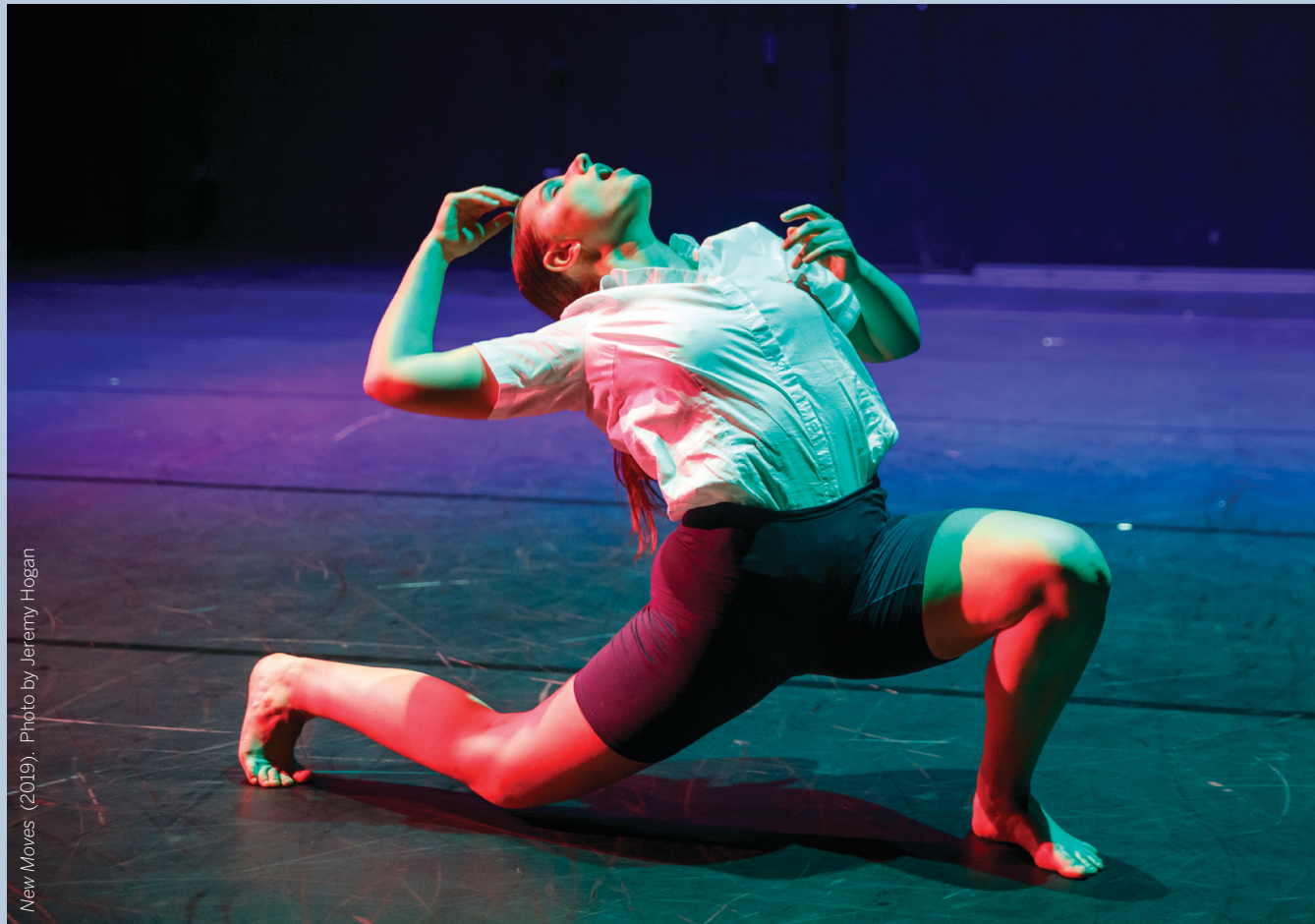
New Moves (2019)