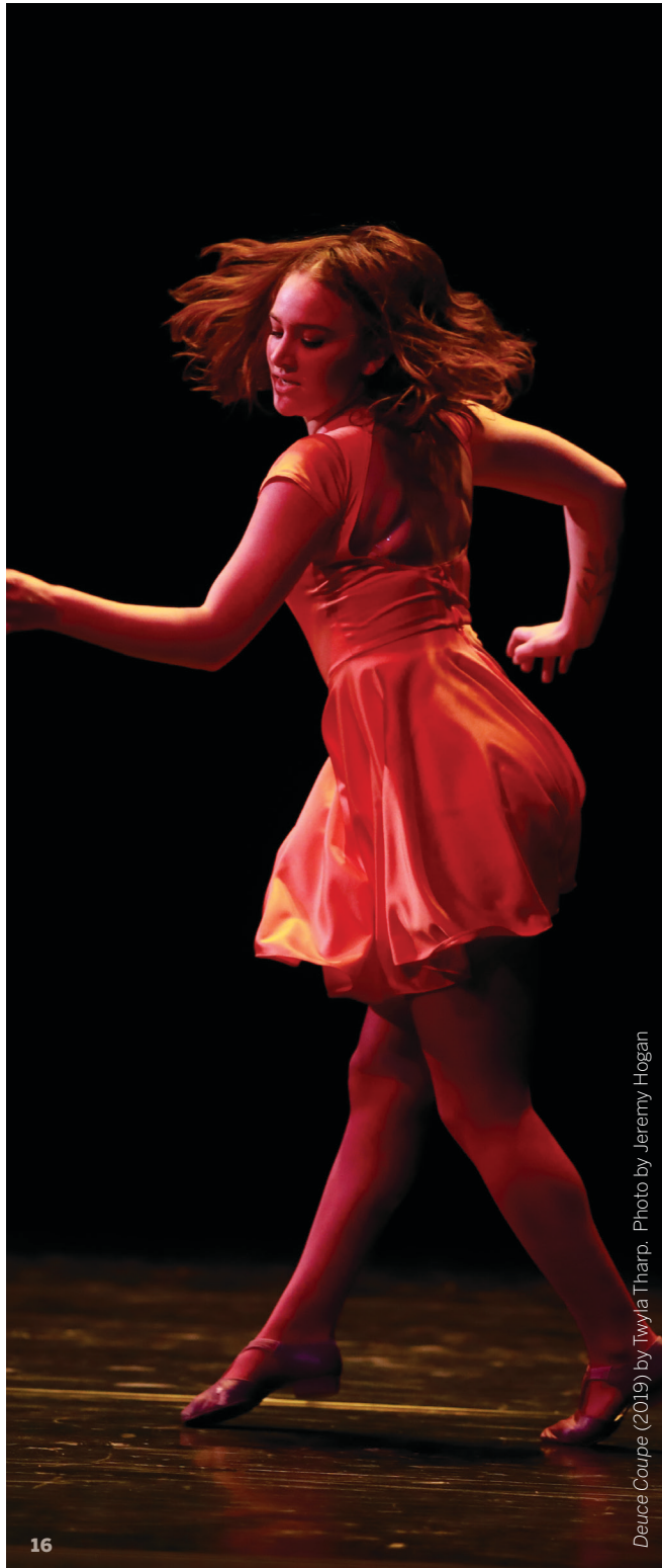
Dance Coupe (2019) by Twyla Tharp.

Indiana University has consistently ranked among the top universities for its rigorous academic programs and athletics. For the last several years IU has ranked in the top 10 most beautiful college campuses. Bloomington Indiana has also continuously ranked among the top college towns for its diversity, opportunities and culture.