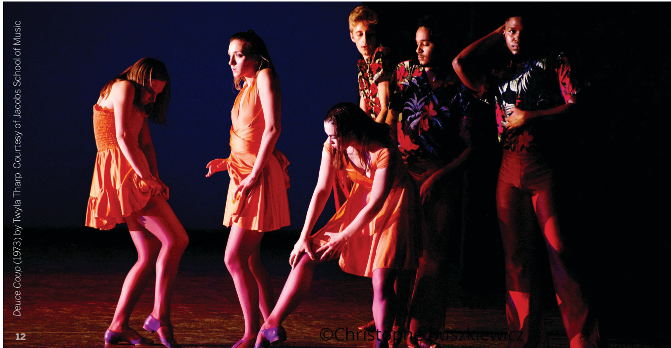
Deuce Coup (1973) by Twyla Tharp.

All majors may become performing members of the Indiana University Contemporary Dance Theatre, and perform in faculty/guest artist concerts as well as dance in student works. Seniors produce their own concert each year. Students can find other performing opportunities with the opera, the musical theatre program, the African American Dance Company, various student groups, and local and community dance events. Dance majors also have opportunities to perform nationally and internationally at various festivals, conferences and faculty residencies.